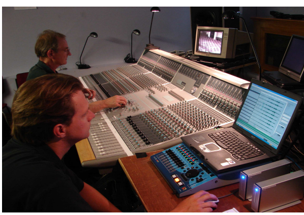
On location — Edinburgh International Festival 2006

Many have attained 'CD of the week/month/year' awards in top newspapers and specialist music magazines, including The Sunday Times, Daily Telegraph, Observer, Independent & Guardian, as well as Opera of the Month in Gramophone and Opera Magazine. Recordings have also received two Grammy & several Gramophone nominations.